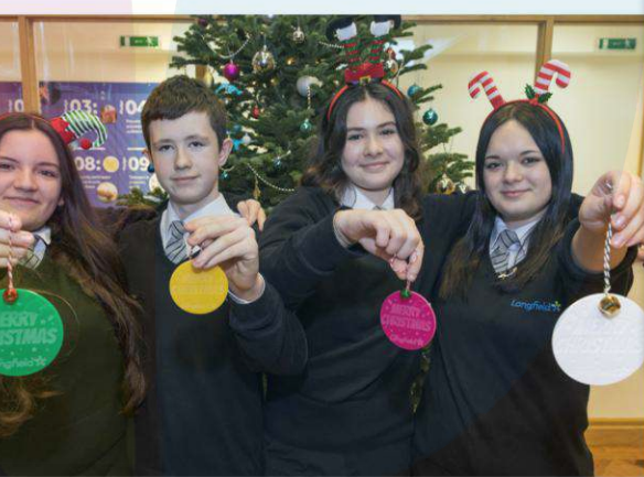
O.A.P Christmas Party