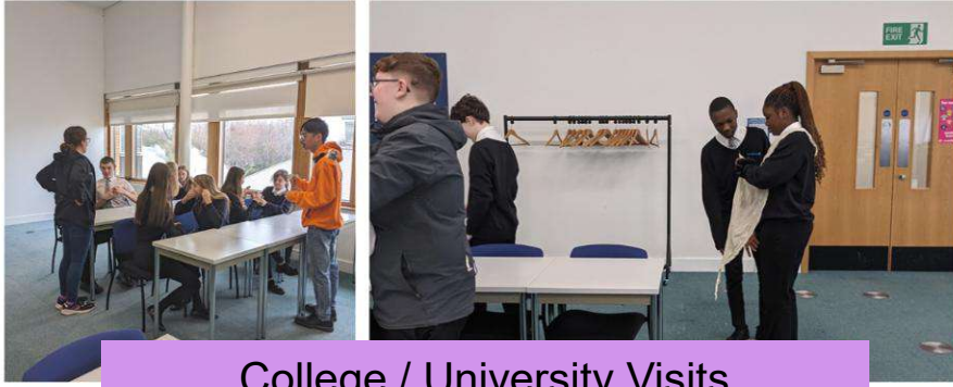
College / University Visits